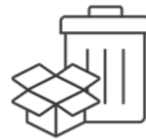
Waste & Packaging

Following the identification of these material topics, an ESG strategy was developed and an ESG Governance Structure was formalised to oversee the implementation of the strategy, with modern slavery prioritised for strategic action. The ESG Governance Structure includes the governance of modern slavery and human trafficking risk and due diligence, and the Board is ultimately responsible for the Group's ESG strategy, reviewing its effectiveness, establishing and communicating ESG-related policies, and reviewing overall progress against the ESG strategy.