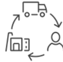
Supply Chain (including modern slavery)