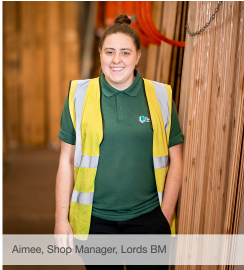
For and on behalf of Lords Group Trading